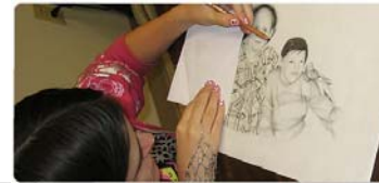
Artwork by student Angie Toner

Get the drawing skills you need to express your creative self. Students will learn perspective, composition, line formation, shading techniques and proportion to draw both realistic subjects and abstract designs. The class, taught by Diana Holcombe, incorporates both group and individual projects to serve each student's artistic interests.